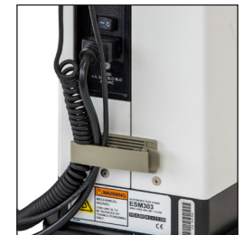
Fig. 4 Adhesive-backed guide is included for cable management