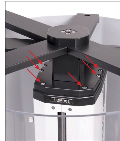
Fig. 1 Attaching the shield assembly to the ESM303 test stand column

With prior firmware versions, the FollowMe™ function will not operate while the door is open, however, the Auto Return function can still be used to return the crosshead to the home position automatically. Contact Mark-10 for upgrade instructions. For further instructions refer to the ESM303 user’s guide.