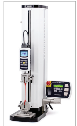
▲ Shown with an ESM303 test stand and G1061 wedge grips

Series 7 force gauges are directly compatible with Mark-10 motorized test stands, to permit functions such as break testing, tensile testing, compression testing, dynamic load holding, PC control capability, and many other applications.