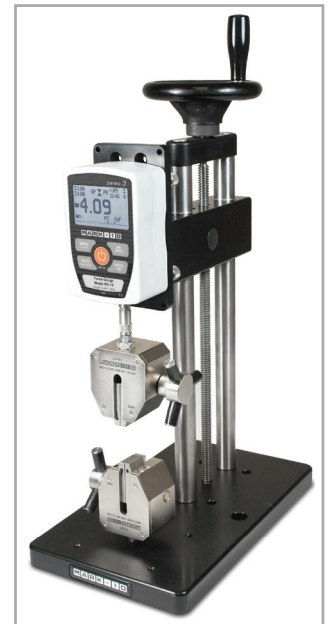
Shown with an ES20 test stand and G1061 wedge grips

Series 3 gauges include MESUR ® Lite data acquisition software, for tabulation of continuous or individual data points. One-click export to Excel button easily allows for further data manipulation.