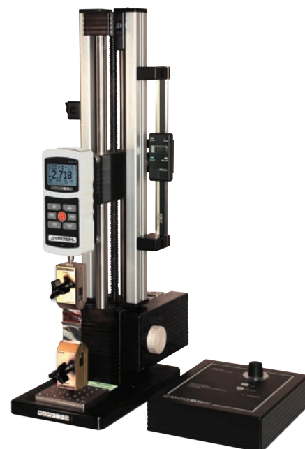
The ESM is shown in a typical tensile testing application, with Series 5 digital force gauge, digital travel display, limit switch kit, and wedge grips